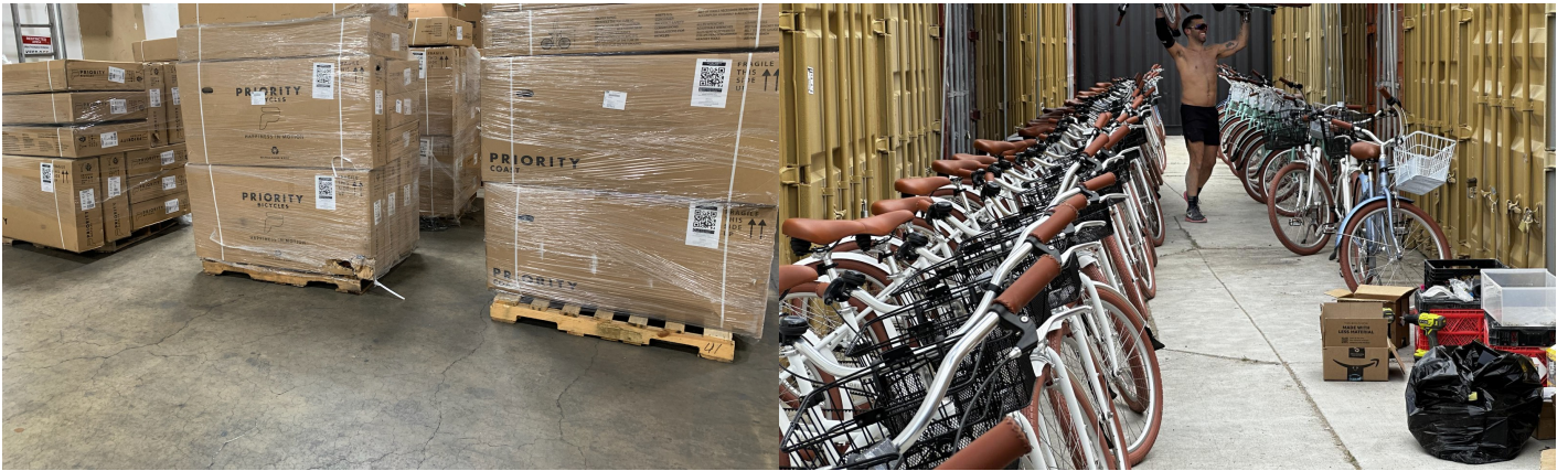
The Turtle Bikes being assembled