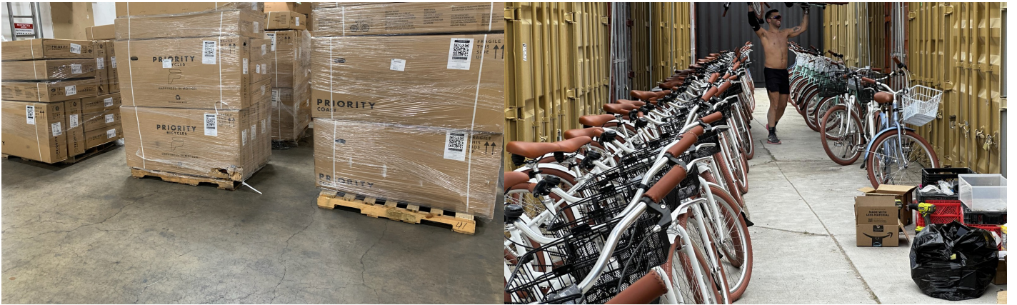
The Turtle Bikes being assembled