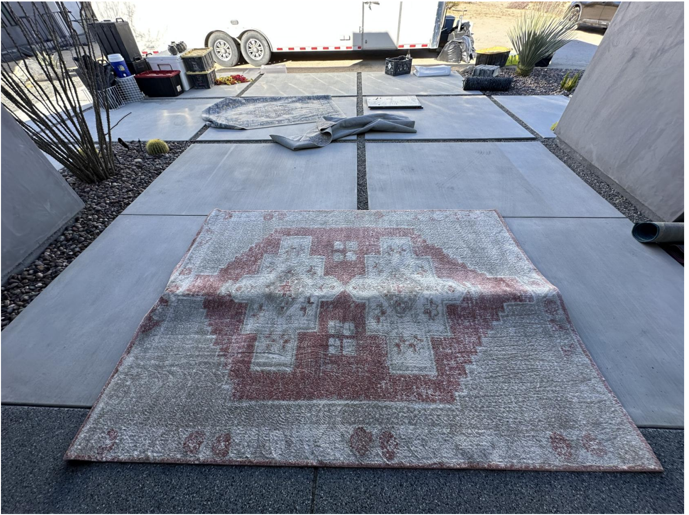
5x7 Thin Shag Persian