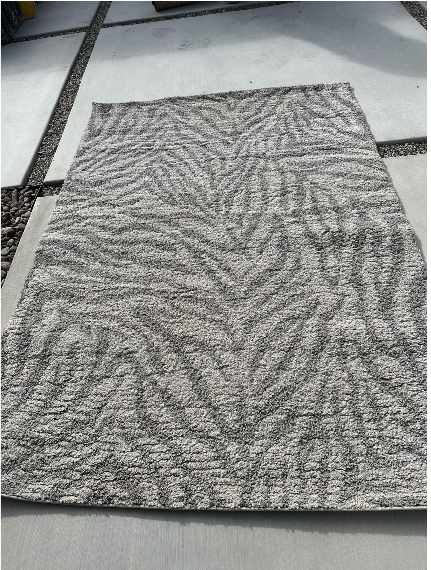
5x7 Low Pile Grey Black Abstract Modern