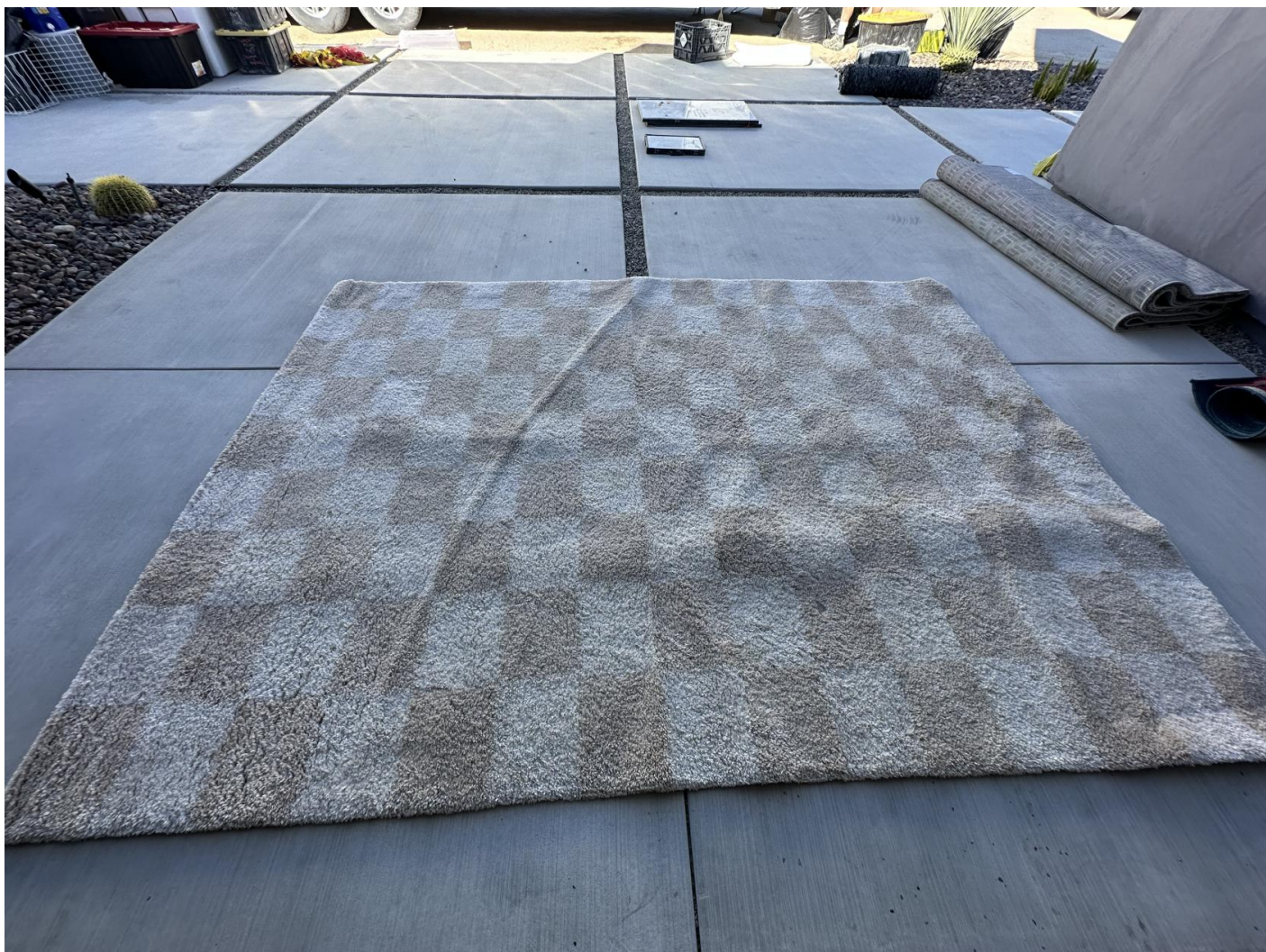
5x7 Grey Shag Checkers