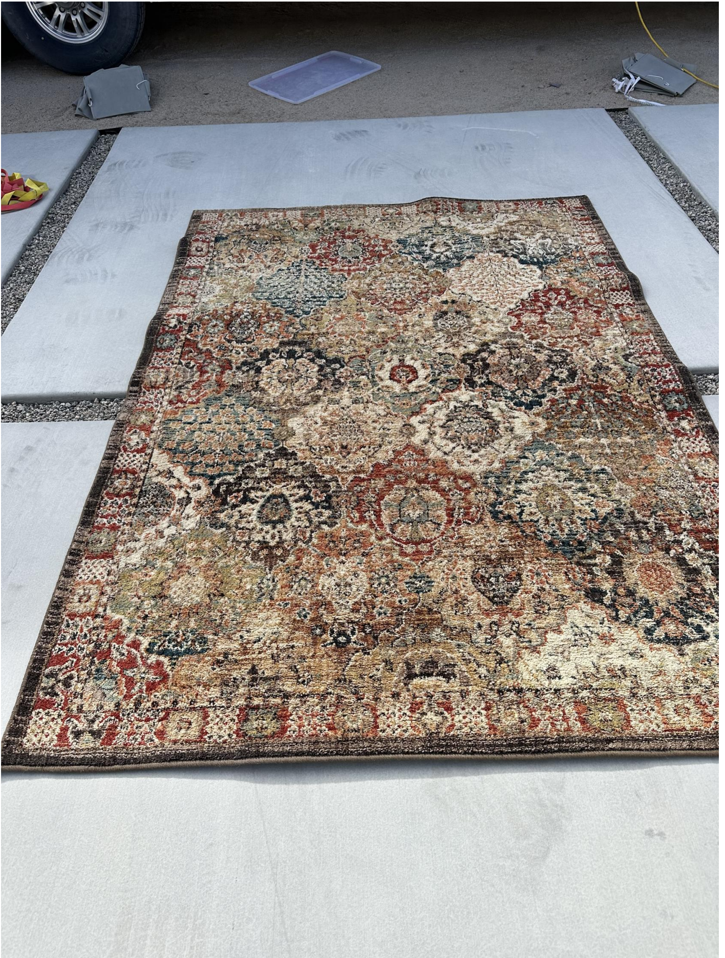
Thin 63" x 87" Light Grey Persian